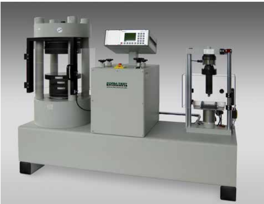
special design with bending testing for prisms (cement/mortar)