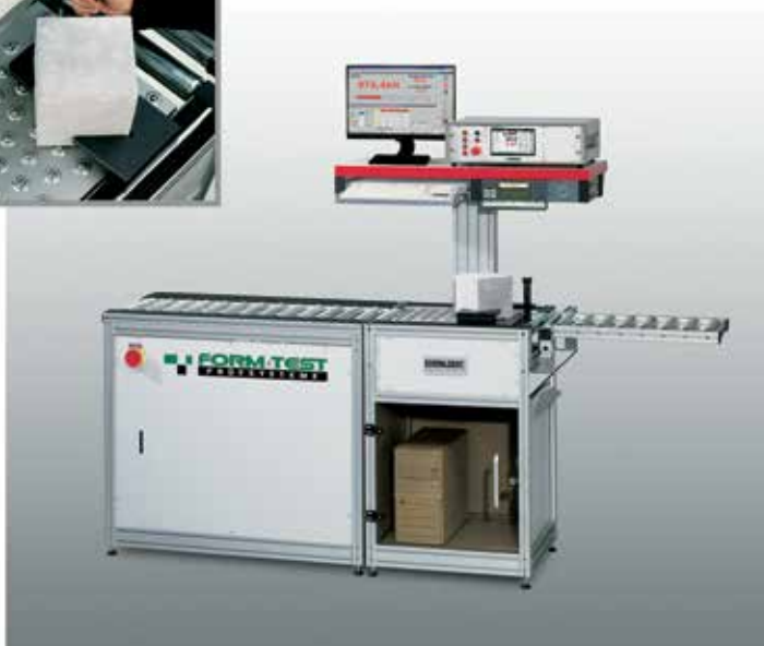
Fig. drive station MEWIS-C40-PC