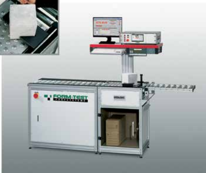
Fig. drive station MEWIS-C40-PC