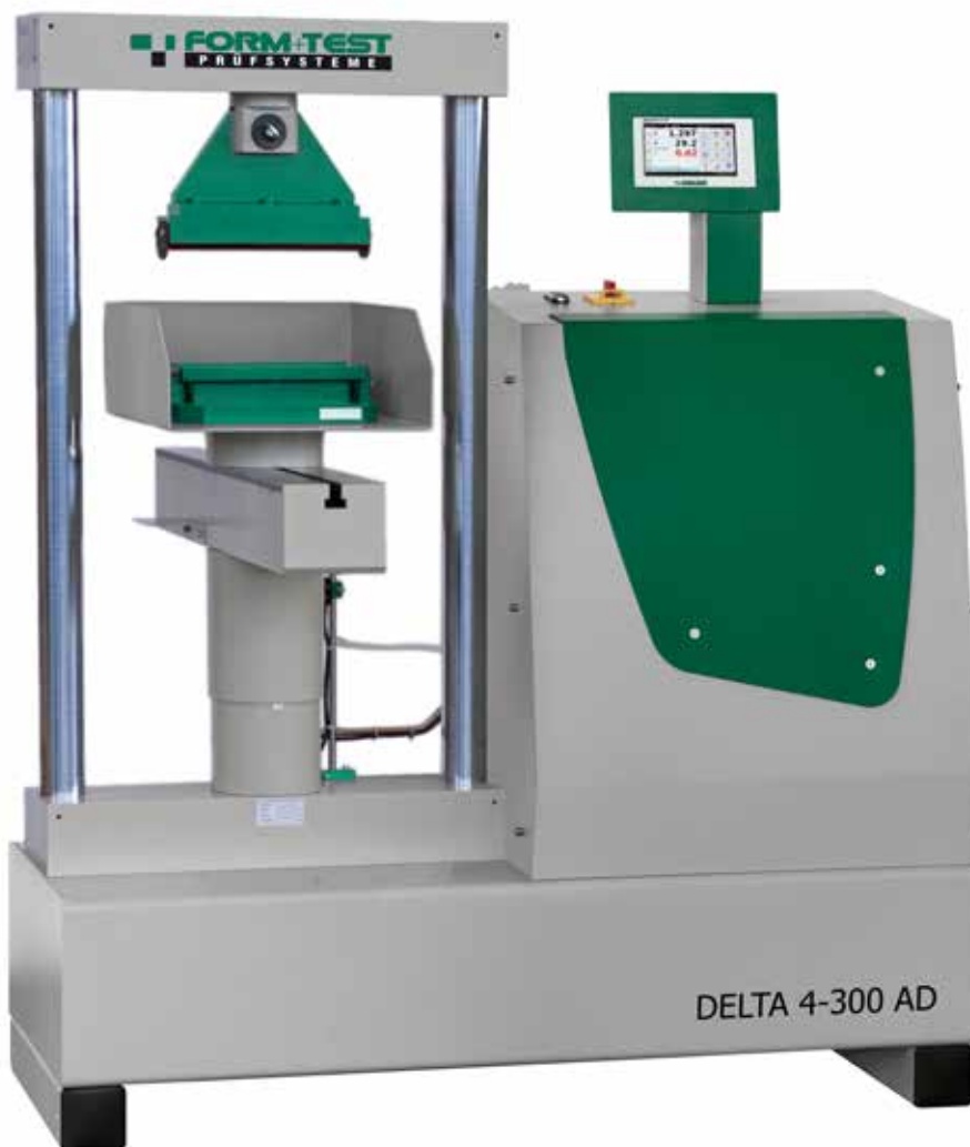
Picture shows testing machine with option 'Splitting test device'