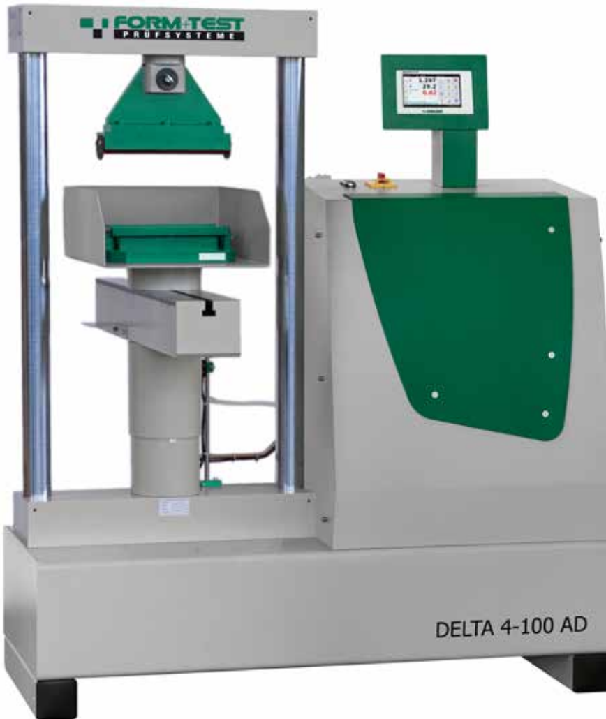
Picture shows testing machine with option 'Splitting test device'